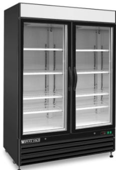
MXM2-48RB (Color: Black)