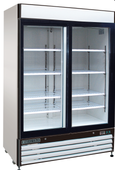
MXM2-48RS (Door: Sliding) IMAGE SHOWN MXM2-48RSB (Color: Black Door: Sliding)

Glass Door merchandisers are designed for durability and visual appeal in promoting your product. Glass door merchandisers are energy efficient and effective at keeping product at exactly the right temperature. This keeps food fresher for longer. The simple-to-use but precise digital controls allows for accuracy in temperature and flexible use of the unit.