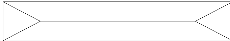
SCORE TILE AS SHOWN