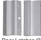
Door Latches (2)