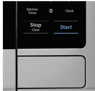
Handle-less, push door modern design matches all styles of kitchens