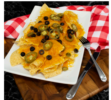
Sensor cook menu for precise cooking and reheating