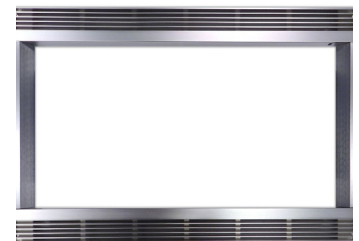
RK52S27 / RK52S30

Internal capacity calculated by measuring maximum width, depth and height. Actual capacity for holding food is less. Product specifications and design are subject to change without notice.