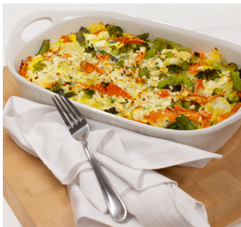
Extra-large, full-sized 2.2 cu. ft. capacity, to cook and reheat larger serving trays and casserole dishes

Innovative features like One-Touch controls, Sensor Cook Technology, Auto Defrost and the Carousel turntable system make cooking and reheating your favorite foods, snacks and beverages easier. With decades of experience designing smart, innovative microwaves, it's easy to see why home cooks throughout the world trust Sharp Carousel.