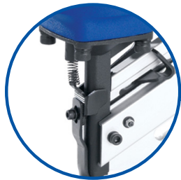
Adjustable Depth Control