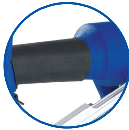
Rubber Comfort Grip