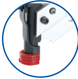
Removeable Decking Tip with Serrated Metal Nose