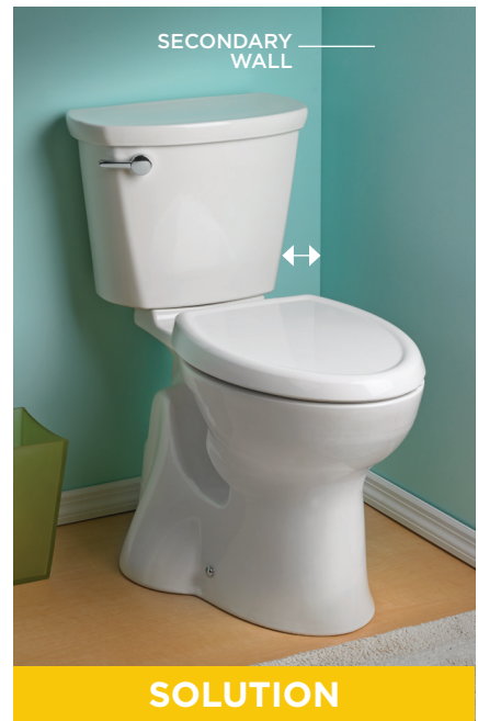
AccessPRO saves both time and money relocating toilet toward or away from the secondary wall (no floor flange outlet change required)