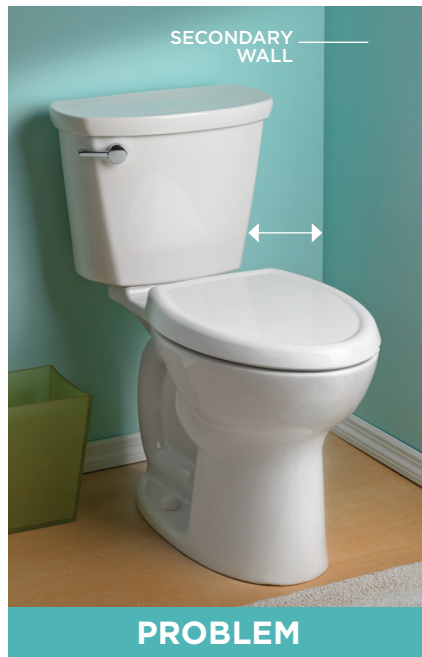
Original toilet location is either too close or too far away from the secondary wall