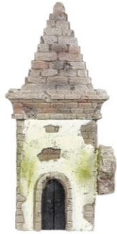
Fountain Top 1x