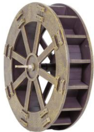
Water Wheel 1x