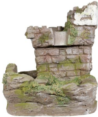
Fountain Base 1x