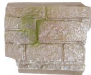
Back Door 1x