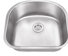
D-Shaped Single Bowl Kitchen Sink