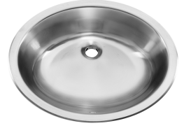
Single Bowl Vanity Sink