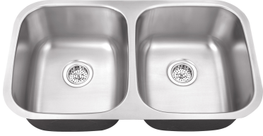
50/50 Double Bowl Kitchen Sink