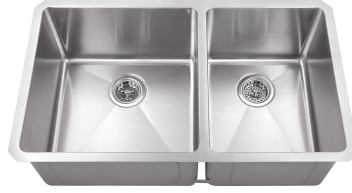
60/40 Double Bowl Kitchen Sink