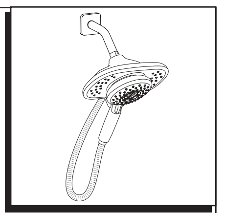
Certified to comply with ANSI A112.18.1M