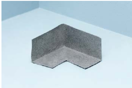
wedi Subliner Dry Sealing Tape Inside Corner