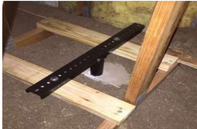
Bolt channels to support structure.