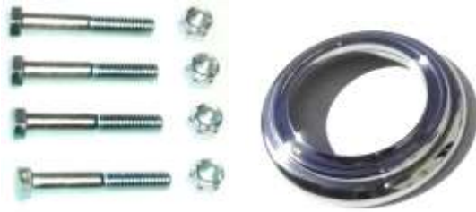
Hardware, Chrome Ring & Adjustable tubes