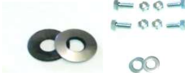
Isolator Washers 1/2 Hardware for Openers