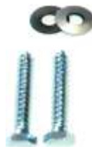
Channel Lag bolts & Isolator washers