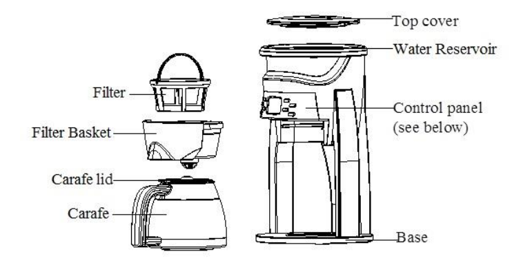
Diagram A: Main Components of the Brazen Plus Brewer