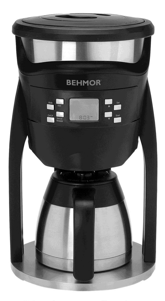
Before using your new coffee maker, please read and understand the manual.