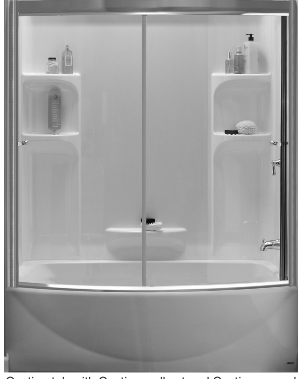
Ovation tub with Ovation wall set and Ovation curved bath door shown.

For color/finish availability and other faucet choices, please see the Product Selector and Pricing Guide.