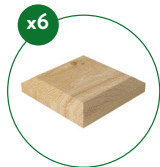
x6 3.5in. x 3.5in. Decorative Caps