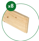
x8 4ft. x 5.5 in. Boards