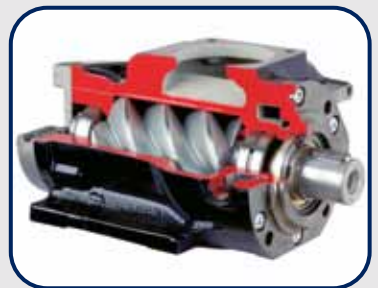
Precision Engineered Rotary Air End