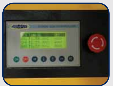
PLC Controller monitors maintenance, temp, oil level, filtration, hours, plus remote start/stop