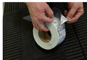
A.1 Peel the TileTab from the roll

NOTE: Nexus and eKo Modular backing use different adhesives and different TileTabs. TileTabs for Nexus backing feature a blue printed back while eKo Modular TileTabs are green.