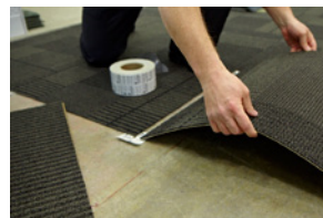
B.1 Position the next module