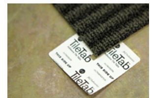
A.3 "THIS SIDE UP" facing up