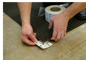
A.2 Place under the module