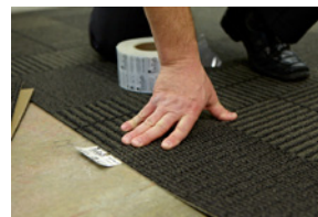
B.2 Press it into place