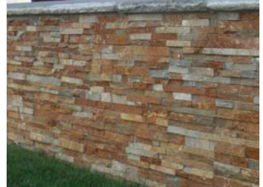
Golden White Ledger Panel

M S International's Natural Stone Ledger panels are trimmed pieces of natural ledger stone affixed together to form modular panels, which allows for the streamlined installation of dry stacked ledge stone veneer. M S International's natural stone veneer panels feature a unique joint design that becomes virtually undetectable after installation. We offer these panels in two styles: Natural stone ledger stepped panels and "L" ledger stepped panel corners for outside corner.