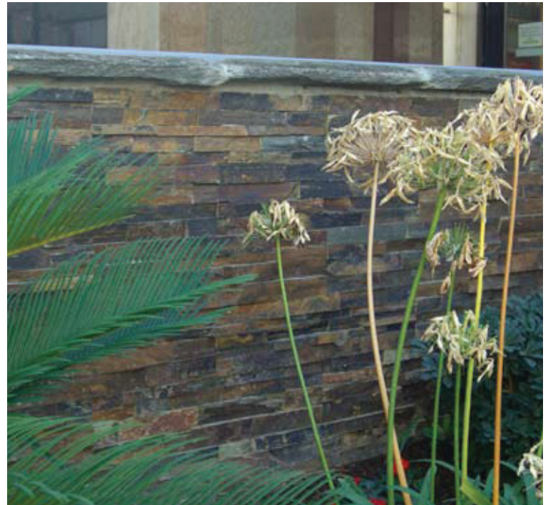
California Gold Ledger Panel