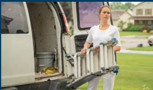
Easier to carry and set up