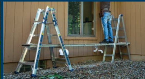
Scaffolding bases require no additional hinges†