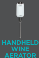
HANDHELD WINE AERATOR

Experience wine at its peak flavor. While traditional decanters require long waiting periods, Ivation wine aerators let wine breathe almost instantly, unlocking the true flavor of any wine, so you can enjoy it the way it was meant to be.