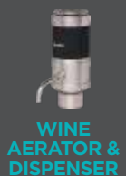
WINE AERATOR & DISPENSER