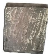
Fountain Back Door 1x