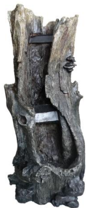
Fountain (3 LED lights pre-installed) 1x