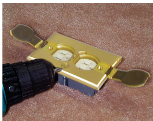
Beautiful flush fit every time!

This floor box is designed to be mounted on a joist or subfloor. It can be installed on the top of the joist or from the bottom if the thickness of the joist is sufficient to allow installation of the box. If the unit is to be installed from the bottom of the joist, check prior to installation to ensure there is sufficient adjustment remaining as this type of installation is non-standard.