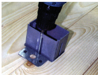
Screw in to adjust to height of flooring or carpet.