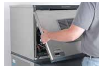
Self-aligning front panel