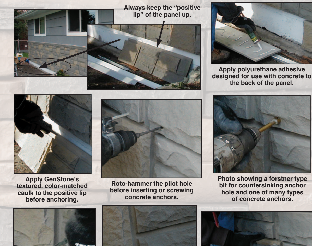
hole and one of many types of concrete anchors.

This method of application would be used for CMU, brick, or any other cement product. Always keep the "positive lip" of panel up. Using PL polyurethane premium construction adhesive (widely available) on the back of the panels, apply approximately 3/8" vertical beads in a tight "s" pattern at 12" intervals starting at one edge. Apply GenStone's textured, color-matched caulk to the positive lip before anchoring. In conjunction with the adhesive you will need to use a cement screw such as a Tapcon. Roto-hammer the pilot hole before inserting or screwing concrete anchors. Then using a forstner type bit, countersink anchor hole. Screw heads should be counter sunk 1/8" and then covered with GenStone color match grout. These screws will hold the panel in place while the adhesive sets as well as increase the durability of the install. One screw in each corner of a panel is adequate. Screws should be of sufficient length to penetrate the panel and bite enough into your substrate to hold tight.