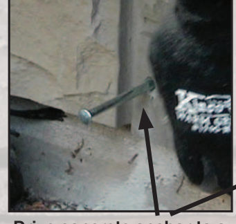
Drive concrete anchor to a depth of 1/8" below flush.