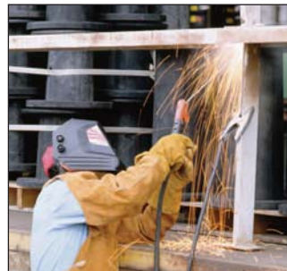
DC stick welding