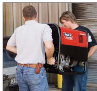
Low-Lift™ Grab Bars