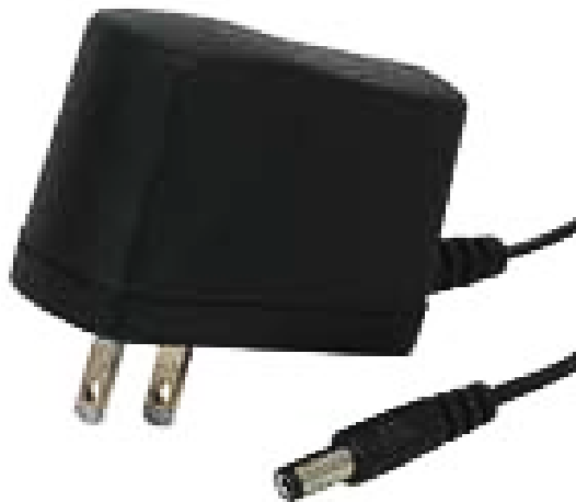
2) 24 VDC power Adapter