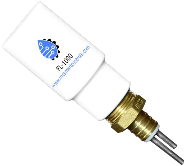
1) FL-1000 Leak/Freeze Sensor