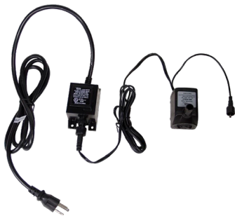
Pump & Transformer 1x