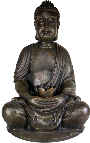
Fountain Top 1x