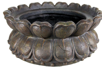
Fountain Base 1x