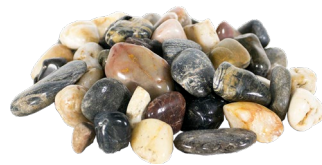
Bag of Rocks 1x