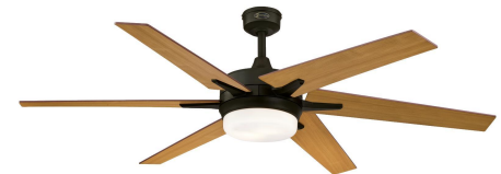
Reversible Cherry Finish Blades