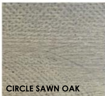
CIRCLE SAWN OAK