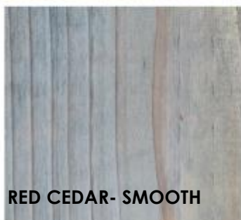
RED CEDAR- SMOOTH