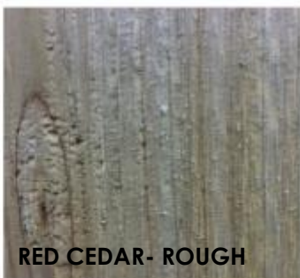
RED CEDAR- ROUGH