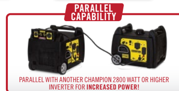
PARALLEL WITH ANOTHER CHAMPION 2800 WATT OR HIGHER INVERTER FOR INCREASED POWER!