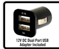
12V DC Dual Port USB Adapter Included