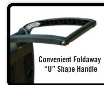
Convenient Foldaway "U" Shape Handle