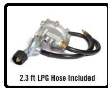
2.3 ft LPG Hose Included