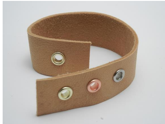
[Photo 7: "Finished" side of eyelets shows on "Smooth" side of work material.]