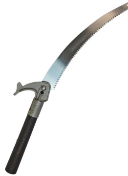
PSC-3FPS1 CompositLock™ Pole Saw Kit Saw Head & 13" Tri-Cut Blade