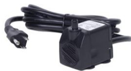
Fountain Pump 1x