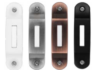
White Nickel Copper Black