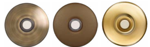
Antique Brass Architectural Bronze Polished Brass